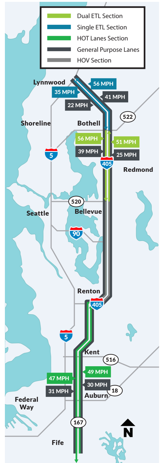
Average peak period toll lane speeds compared to average general purpose lane speeds from January to March 2020.